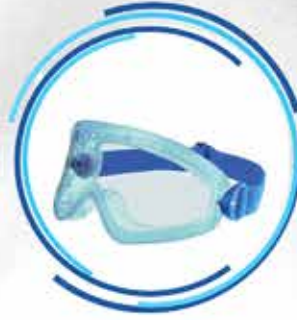
DRAGER X-PECT 8510 CLEAR GOGGLES CODE: SA-GOGGCL-8510