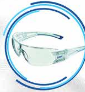
DRAGER X-PECT 8330 CLEAR SPECTACLES CODE: SA-SPECCL-8330