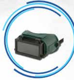
SQUARE LIFT-FRONT WELDING GOGGLE CODE: SA-WELGOGG-B605