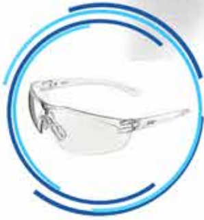
DRAGER X-PECT 8320 CLEAR SPECTACLES CODE: SA-SPECCL-8320