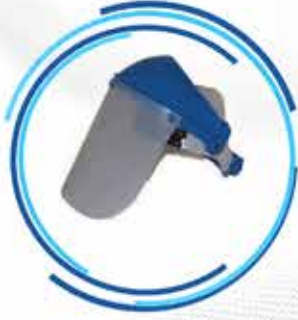
SA-FACESHIELD CODE: OT5