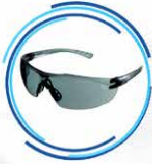
DRAGER X-PECT 8321 GREY SPECTACLES CODE: SA-SPECGY-8321