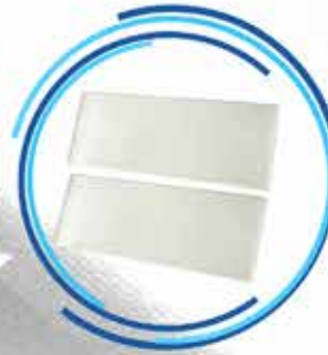
WELDING LENSES - CLEAR CODE: SA-WELLENS-CL