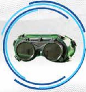
ROUND LIFT-FRONT WELDING GOGGLE CODE: SA-WELGOGG-B606