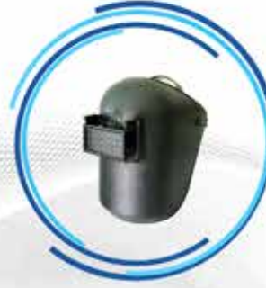
WELDING HELMET C/W LENSES EN175 CODE: SA-WELHEL-B303L