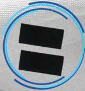
WELDING LENSES IN SHADE 09 / 10 CODE: SA-WELLENS-09 / 10